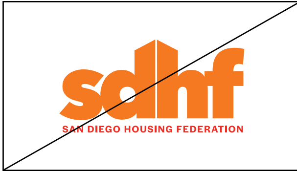
DO NOT CHANGE THE COLOR

The following are examples of how the logo should not be used. This keeps the integrity of the brand intact. The same rules apply to the secondary logo.