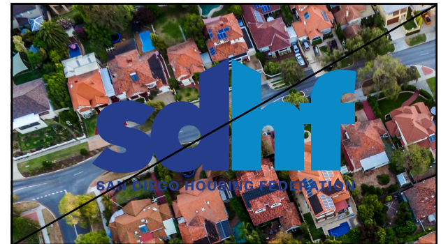
DO NOT PLACE LOGO ON A BUSY IMAGE