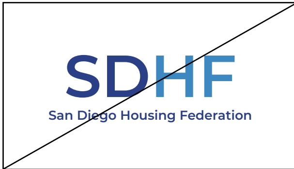
DO NOT RECREATE THE LOGO