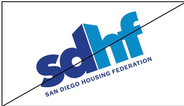
DO NOT ROTATE THE LOGO