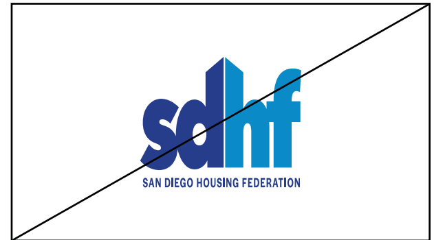
DO NOT STRETCH LOGO IN ANY DIRECTION