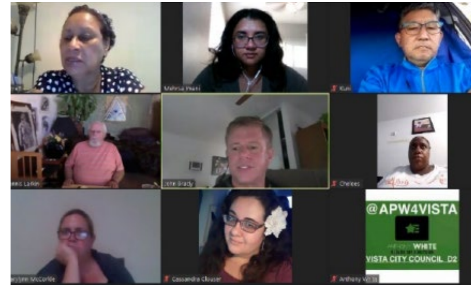
HEAL members on Zoom

HEAL is looking to expand its network in the coming months, and begin engaging new individuals with lived experience of homelessness into the program. Hopefully in the new year a new leadership and advocacy training can be offered to new HEAL members.